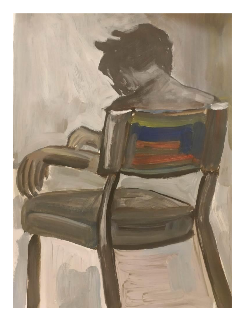
fig 1, 42x59.4cm, Acrylic on Paper