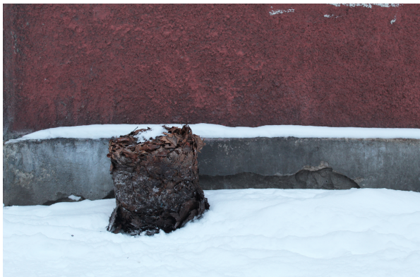
( 22 )