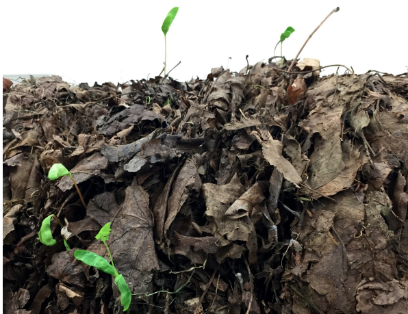
( 18 )