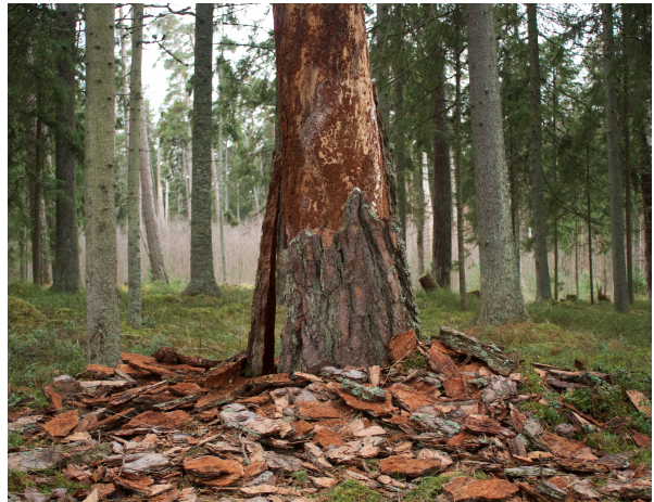
( 19 )