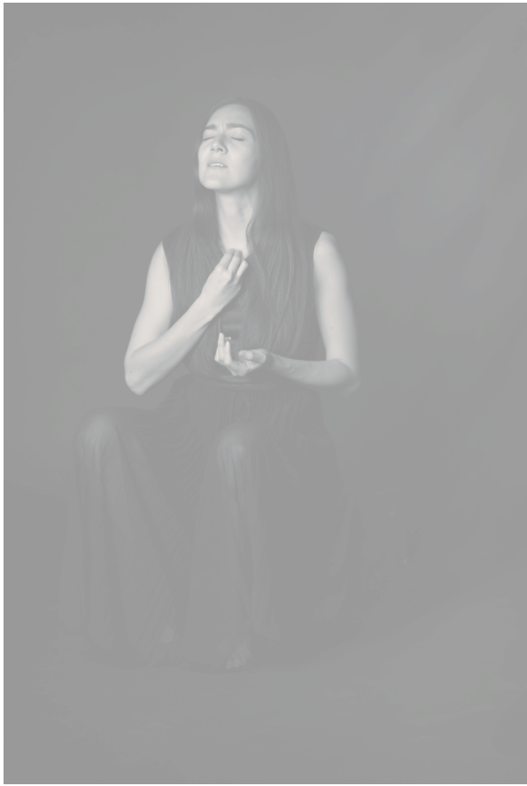
( 6 )