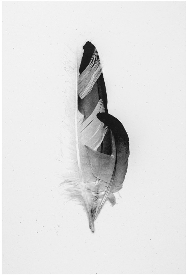
( 7 )