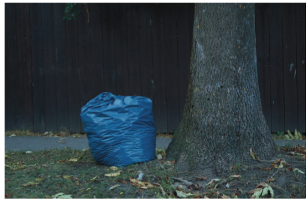
( 23 )